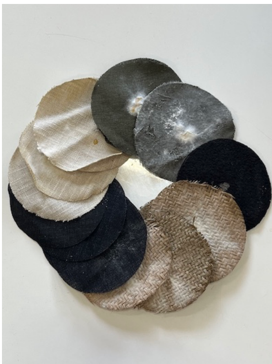
To start with, the mycelium materials were compared with other renewable materials.

The Sustainable Upholstered Furniture research project was initiated in the Dutch foundation SIGN's Livinglab Bleiswijk and sponsored by the Dutch Ministry of Agriculture, Nature and Food Quality. SIGN's projects focus on using garden and organic waste to grow mycelium for various applications. This fungus is a mass of thread-like cells that form the fast-growing root-like structures under the soil. Producing mycelium only leaves a very small carbon footprint and the fungus is biodegradable. It's also lightweight, fireproof, absorbs sound, and has insulating and antibacterial properties. All these aspects mean the material has huge potential for aircraft construction (seats and partitions) and upholstered furniture.