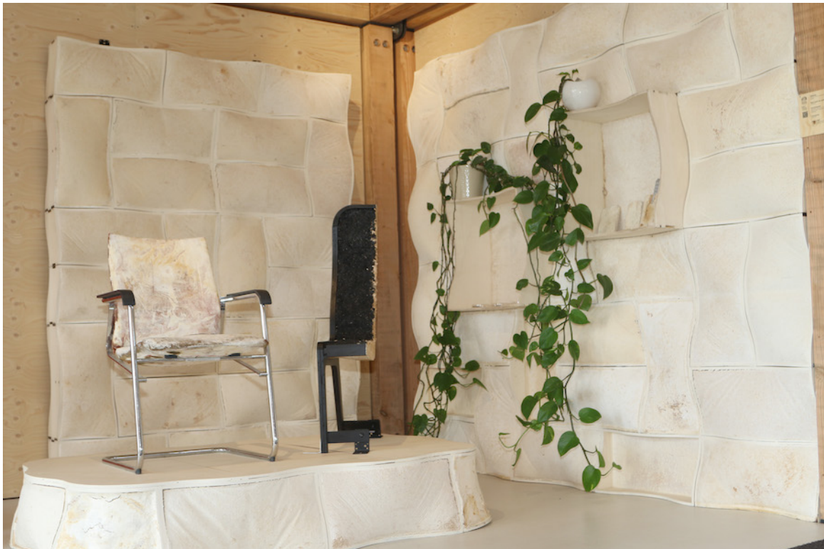
The showcase in Floriade's Natural Pavilion with upholstery on a Wilkhahn chair and a wall lined with mycelium.

Bad Münster, Almere (NL), August 2022. North German company Wilkhahn has been actively involved in bringing about an ecological change in the office furniture industry for over 30 years. Back in 1991, it was the first manufacturer worldwide to launch an ecological design concept. This approach involves embracing a circular economy during the development of its durable and high-quality seating and tables. The company won the German Environmental Award in 1996 and has repeatedly become involved in basic research into new materials in order to sponsor projects and build on its own expertise in this area too.